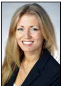
DR. ROBERT ISAACSON DISTINGUISHED SERVICE AWARD

On May 30th, at the conclusion of the 2019-2020 year we were honored to present two of our members very well deserved awards and thank them for their dedication and contributions.