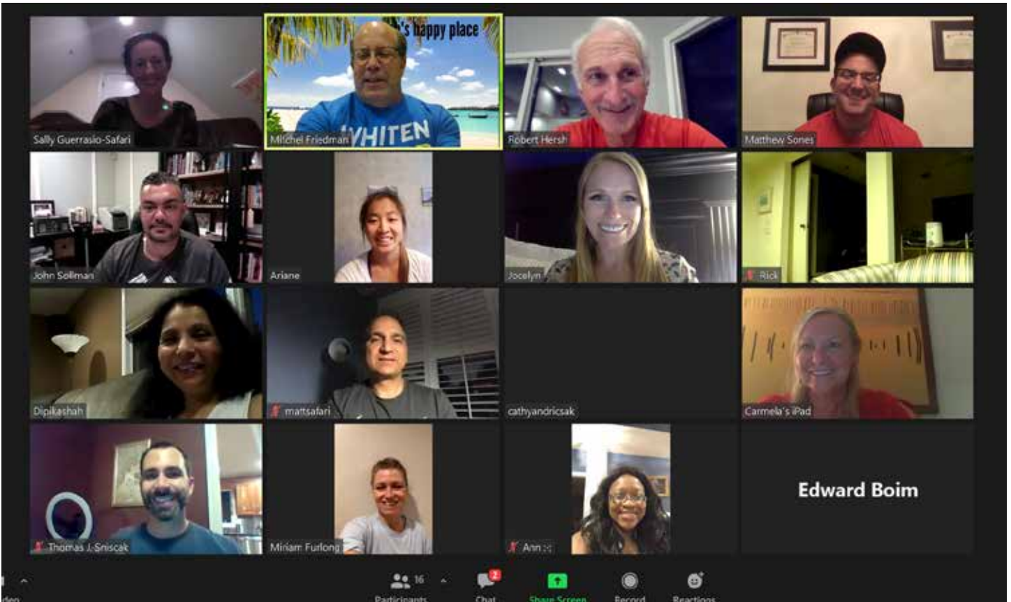
Zoom Organizational Meeting MOCDS 8/11/2020