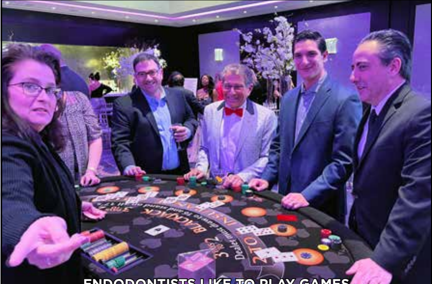
ENDODONTISTS LIKE TO PLAY GAMES