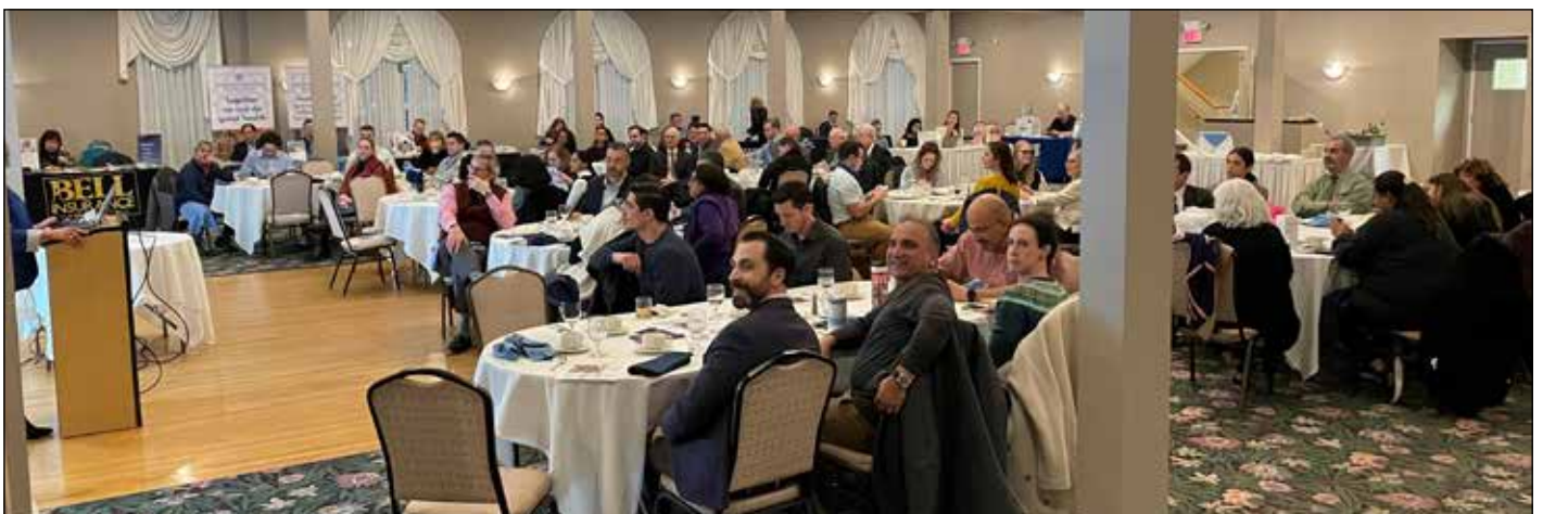
NJDA Leadership Dinner meeting included 54 participants and 10 vendor sponsors