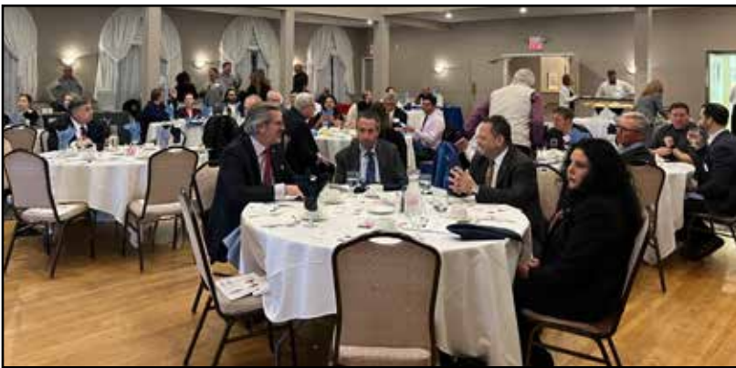
MOCDS member dentists, local dental residents, sponsors, and NJDA Leadership at the Waterview Pavilion for the NJDA Leadership Tour.