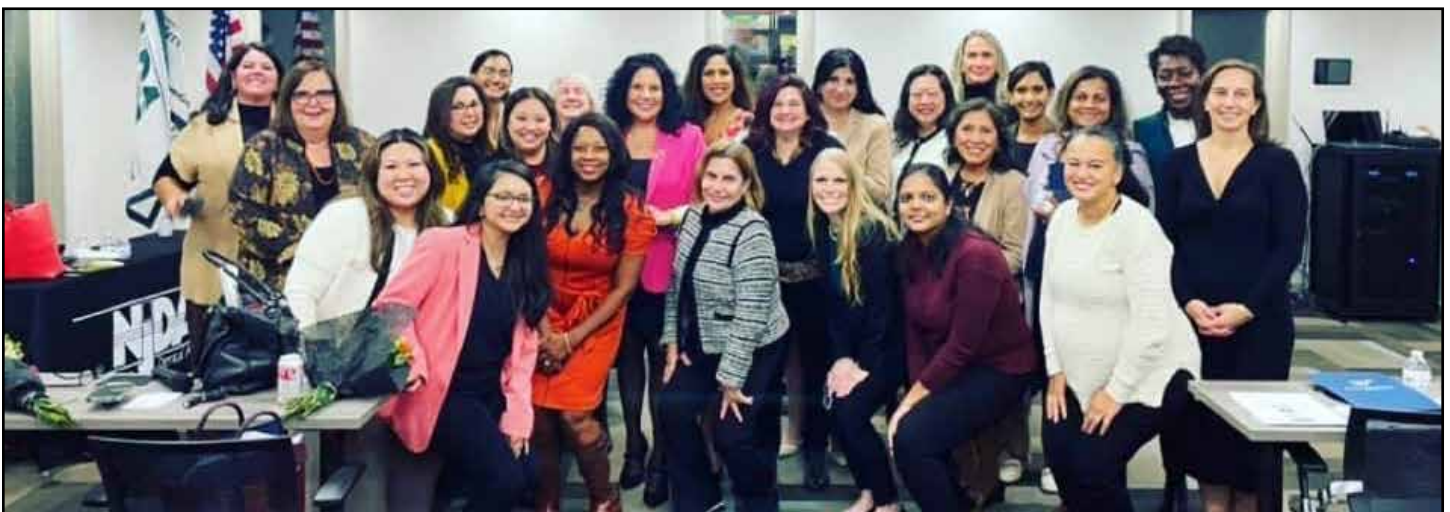
MOCDS members at NJDA Womens event