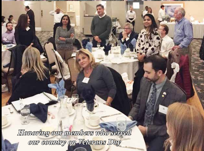
Honoring our members who served our country on Veterans Day