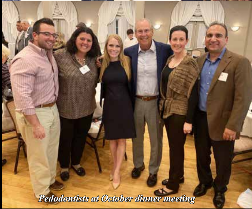
Pedodontists at October dinner meeting